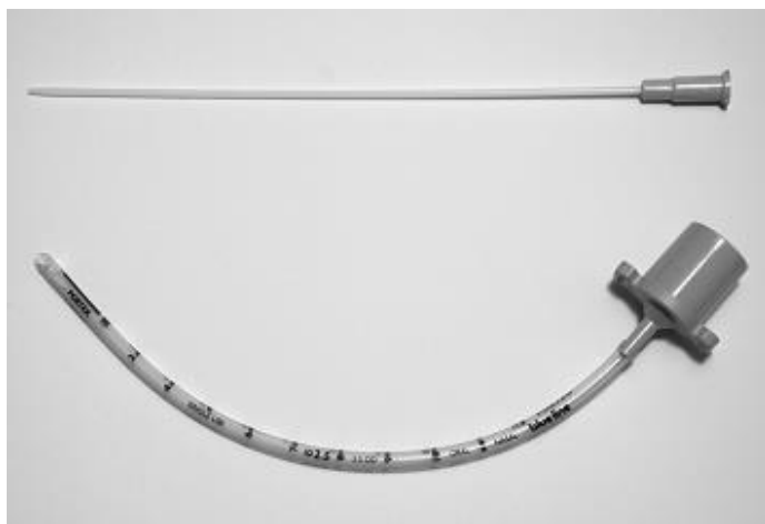
Figure 1 MIST catheter (above) compared with standard 2.5 mm endotracheal tube, which has an external diameter of 3.5 mm

The method of surfactant instillation by flexible feeding tube has several technical difficulties that may limit its widespread application. Clinicians who solely practice oral intubation will be unfamiliar with Magill’s forceps, and may find them cumbersome and hard to use. Additionally, the highly flexible feeding tube may on occasions be difficult to insert through the vocal cords, and also difficult to maintain in position once inserted. For these reasons, and with the recognition of the potential benefits of MIST, our research group has developed an alternative and novel MIST technique using a narrow bore vascular catheter (16 gauge Angiocath, Product No. 382259, Becton Dickinson, Sandy, UT, USA). 35 This catheter has an external diameter of 1.7 mm, and a length of 135 mm, and is made from fluorinated ethylene propylene polymer (Figure 1). It has the dual